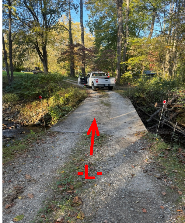
View Looking Upstation