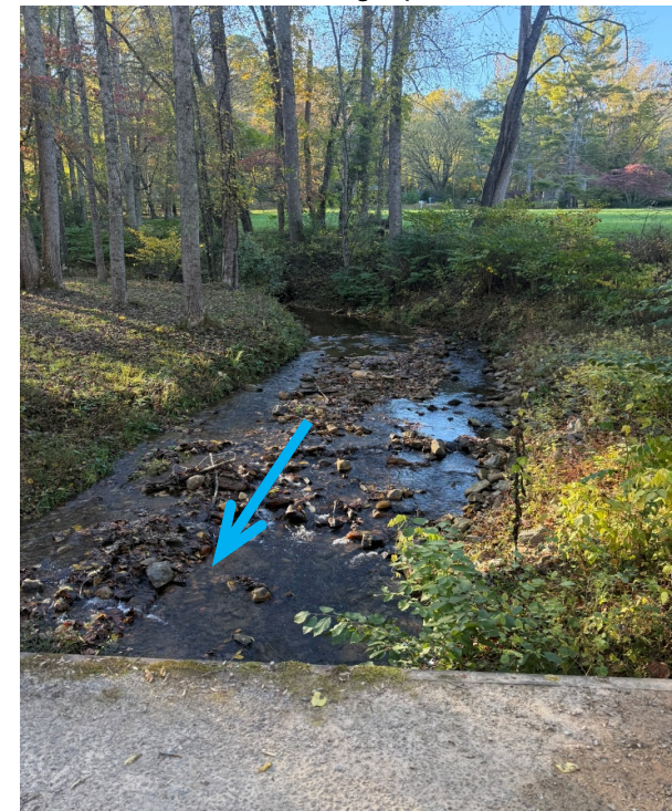
View Looking Upstream