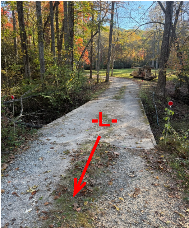
View Looking Downstation